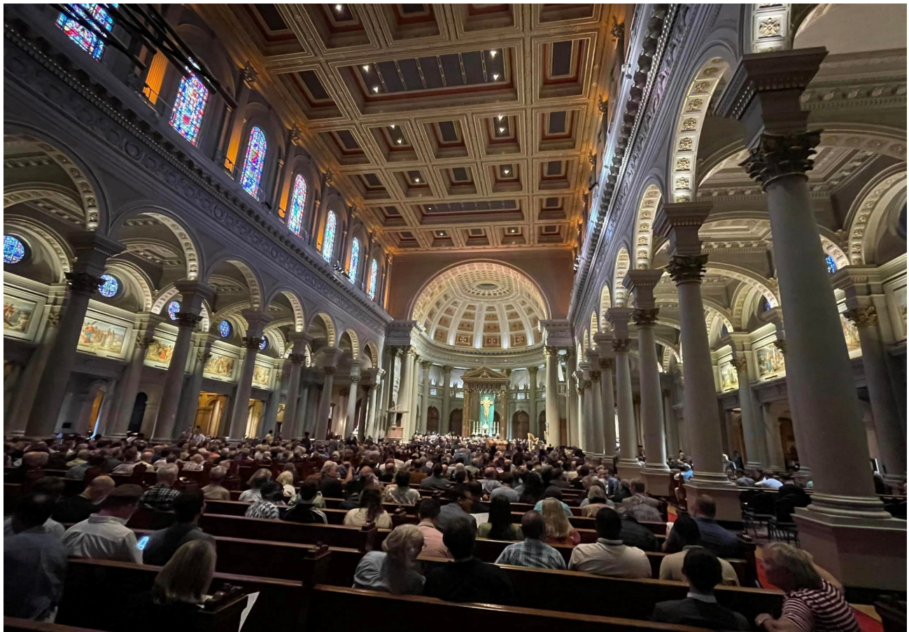
Audience at St. Ignatius Church Concert