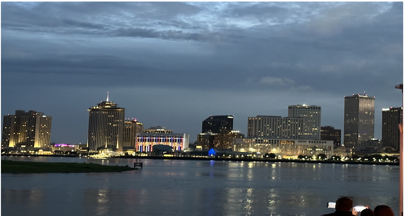
A view of the city from our jazz riverboat cruise on a paddlewheel boat, our last night in New Orleans.