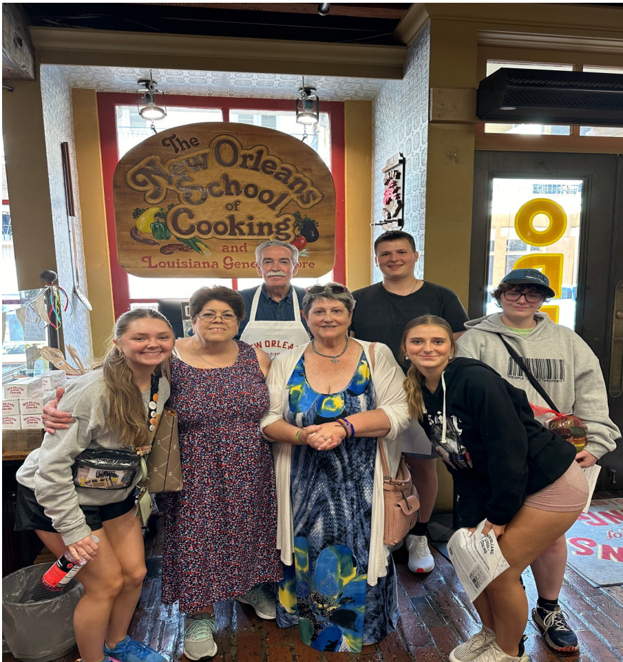
After the gathering ended, we ended a Cajun cooking class at a New Orleans cooking school!