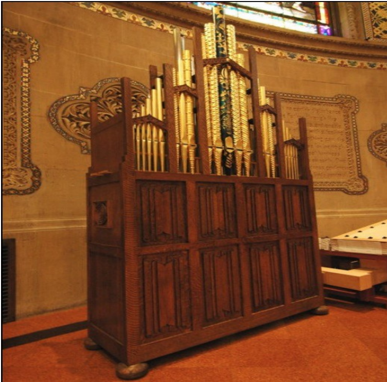
Our Tudor-style organ at Stanford University